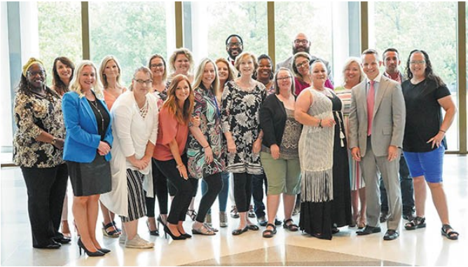
The many faces of the TDH campaign include those who have struggled with addiction, family members, providers and community activists.

ARTICLE REPRINT | Nashville Medical News | September 9, 2019 | CINDY SANDERS | https://www.nashvillemedicalnews.com/news.php?viewStory=3269